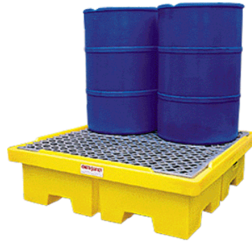
Ultra Spill Pallets

We'd be happy to set up an appointment today!