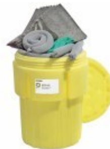
95-Gallon Spill Kit