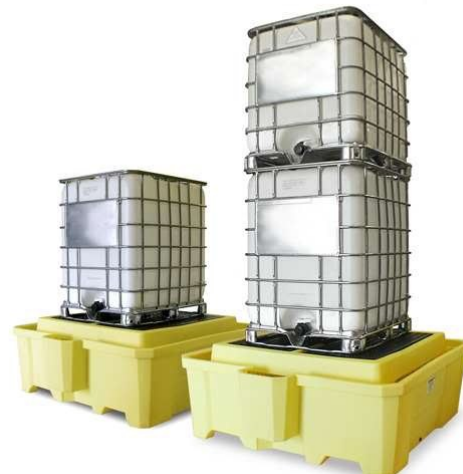
Ultra IBC Spill Pallet Plus

Your one stop shop for containment needs with the service you deserve!