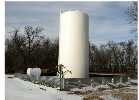
33" Rectangle Containment