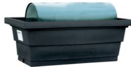
Ultra-275 Containment Sump

NBI Engineering Services and Naastad Brothers, Inc.