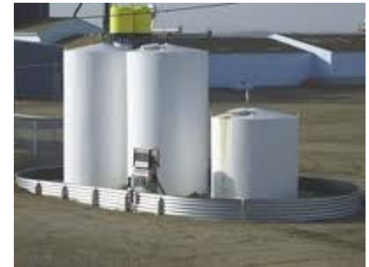
33" - Oval Containment